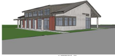
5 PERSPECTIVE - SW