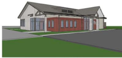
4 PERSPECTIVE - SE