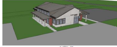
2 AERIAL - SW