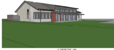
6 PERSPECTIVE - NW