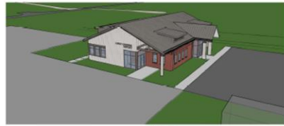
4 AERIAL - SE